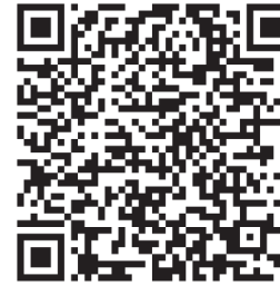
Fig. 1: ICP-SOL2-P QR code

Or scan the specific product QR code for documents: