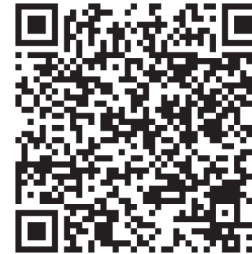
Fig. 2: ICP-SOL3-P QR code